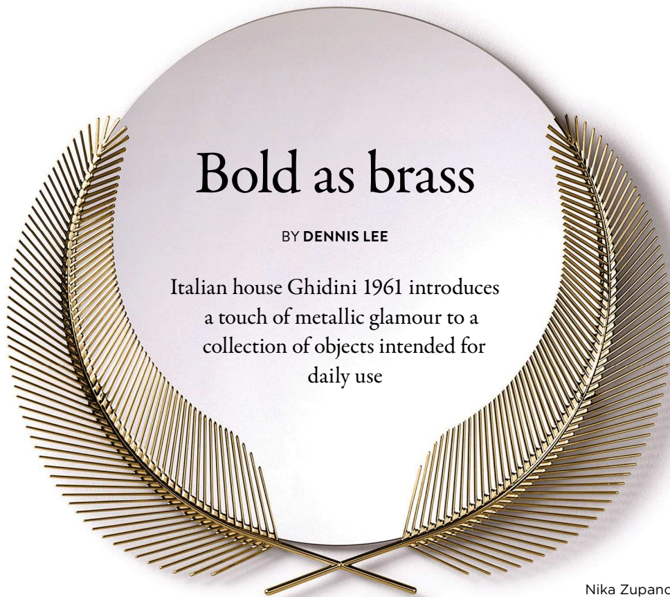
Nika Zupanc's Sunset mirror

Italian house Ghidini 1961 introduces a touch of metallic glamour to a collection of objects intended for daily use