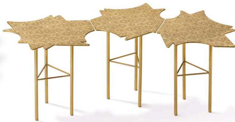
Alessandro Mendini's Ninfee coffee tables