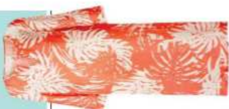
Linen pain relief kufan, £100, at 020 7887 6744, www.loom.co.uk