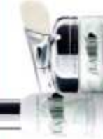
Brilliance brightening mask, £200.5, by Lee 0200 654 2661, www.leebeauty.com