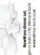
Nowave dinner set, pieces from £29, Wilsey & Bloch www.wilseybloch.com