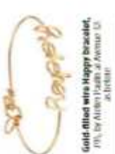
Gold-filled wire Happy bracelet, £19, by Amber Faith at Avenue 2 as below