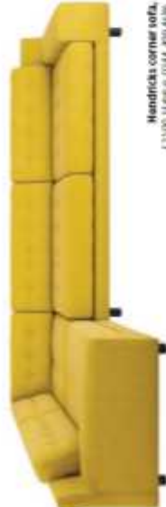
Handricka corner sofa, £2,500 (reduced from £2,999), www.budat.co.uk