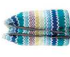
Rufus twinning beach bag, £110, by Missoni Home at Amada as below