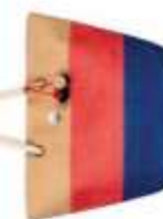
San Saekar straw beach bag, £30, by Jay 0208 867 1405, www.jay.co.uk