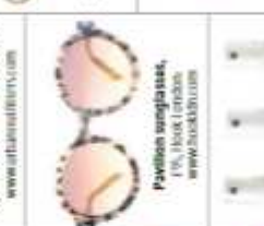
Pavilion sunglasses, £95, Block London www.blocklondon.com