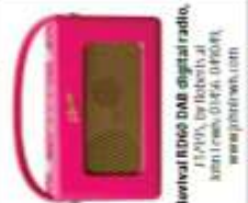
Festival RINGO DAB digital radio, £149.95, by Roberts at John Lewis, 01753 499049, www.johnlewis.com