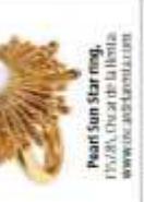
Pearl Star ring, £75.95, by Chi at La Perla www.laperla.com