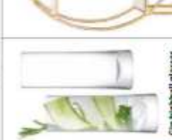
Gin Highball glasses, £22 for two, £144 for six, by LA International 02019 789171, www.lainternational.com