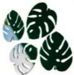
Cheese plant leaf coasters, £15, by Design Museum Shop as below