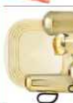
Form tea set, £99.95 (was £146.74), from Form 0200 7400 0940, www.formtea.com