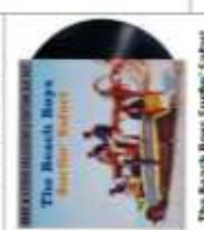
The Beach Boys Surfing collector's edition vinyl, £72, Urban Childcare in store or at www.urbanchildcare.com