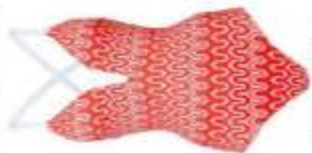
Optic Wave swimsuit, £304, by Scabbly at Beach Cals 020 7126 4141, www.beachcals.com